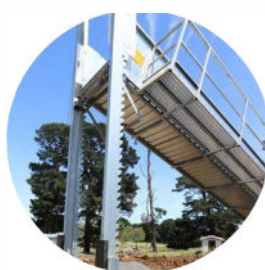
SELF LOCKING SAFETY BAR