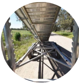
HEAVY DUTY REINFORCED FRAME