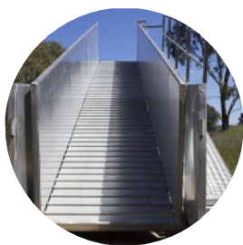
915MM INSIDE WIDTH