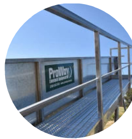
NON SLIP WALKWAY WITH HANDRAIL