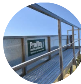
NON SLIP WALKWAY WITH HANDRAIL