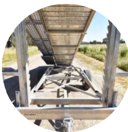
HEAVY DUTY REINFORCED FRAME