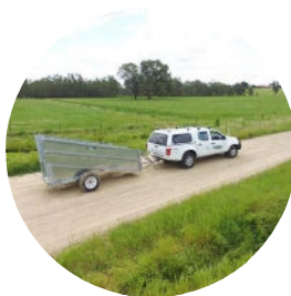
SUITABLE FOR TRANSPORT BETWEEN MULTIPLE SITES