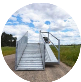
925MM INSIDE WIDTH