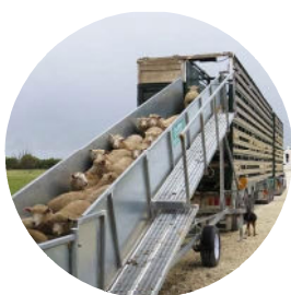
915MM INSIDE WIDTH