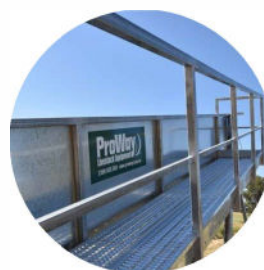
NON SLIP WALKWAY WITH HANDRAIL