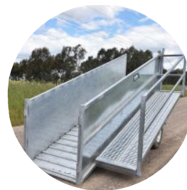
NON SLIP WALKWAY